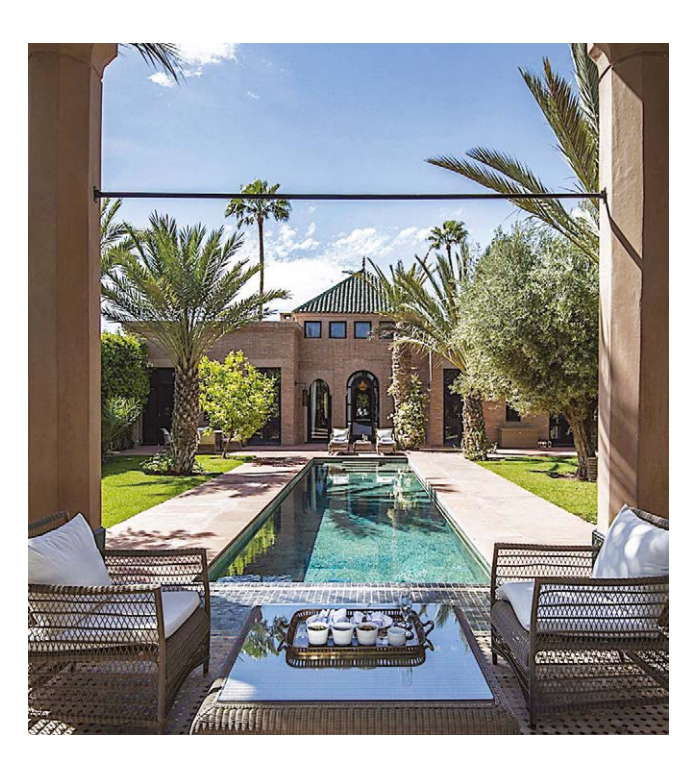
4 VILLAS OF 580m² (6250 sqf) - 1 bedroom 1 VILLA OF 700m² (7535 sqf) - 2 bedrooms

Our Suites are the perfect symbol of Moroccan art of living. They have a separate living room and two beautiful terraces overlooking the pool. The elegant bathrooms, made out of black and white Zellige tiles and marble, have a shower and a large bathtub.