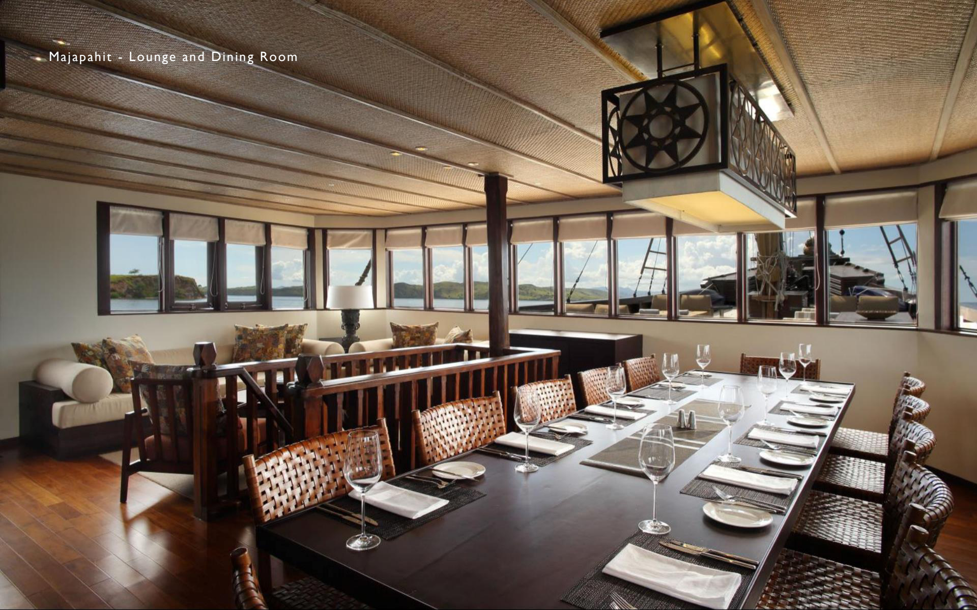
Majapahit - Lounge and Dining Room